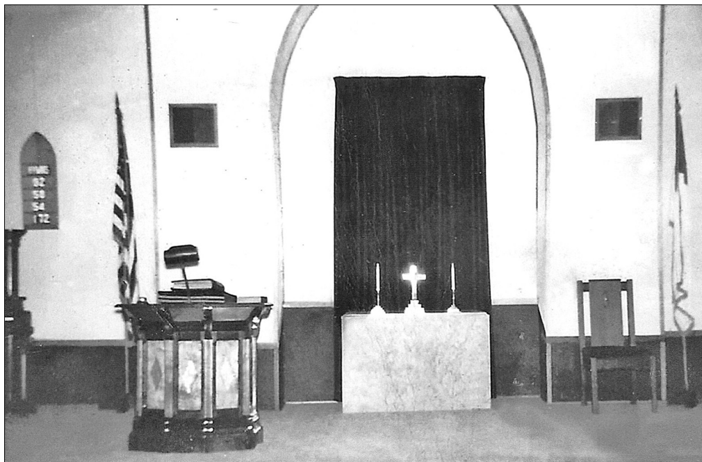
The interior in 1954 after the remodel.